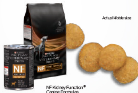
NF KidneyFunction ® Canine Formulas