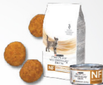
NF KidneyFunction ® Feline Formulas

Refer to the backside of your product package for feeding instructions.